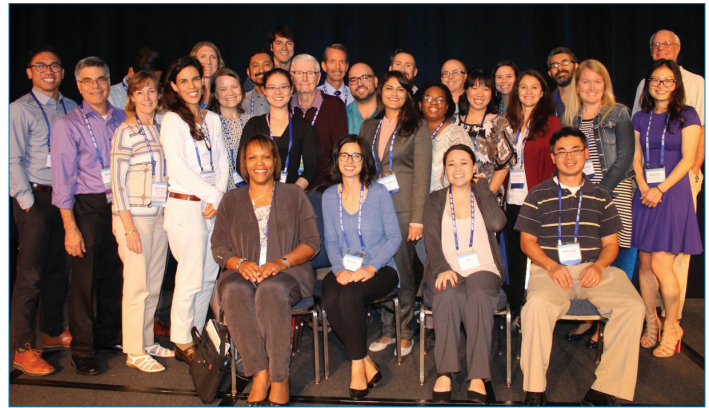
MERF SCHOLARSHIP RECIPIENTS AT 2016 ESSENTIALS OF ADDICTION MEDICINE CONFERENCE

The Medical Education and Research Foundation for the Treatment of Addiction (MERF) also received part of the grant to expand their scholarship program at the Essentials of Addiction