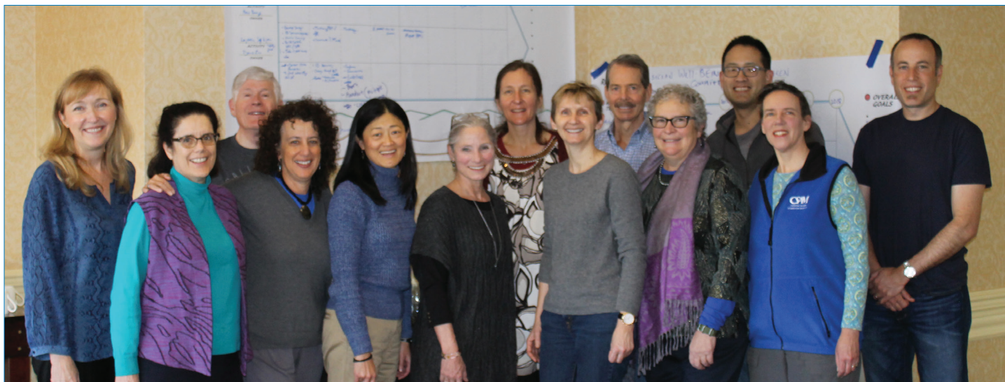
CSAM EXECUTIVE COUNCIL AND COMMITTEE CHAIRS, JANUARY 31 IN BERKELEY